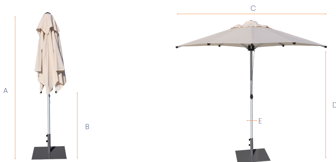
Diagram Legend (sizes are in mm)